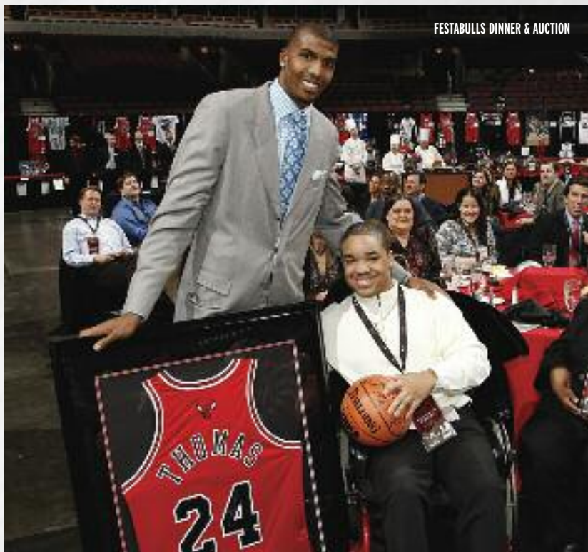
FESTABULLS DINNER & AUCTION

mission. Items such as autographed jerseys, basketballs, shoes and warm-ups from players past and present are displayed for silent bidding throughout halftime of each home game.