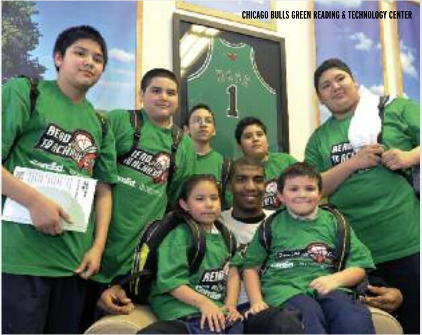
CHICAGO BULLS GREEN READING & TECHNOLOGY CENTER

renovated space which was constructed entirely with environmentally friendly materials and energy efficient computers.