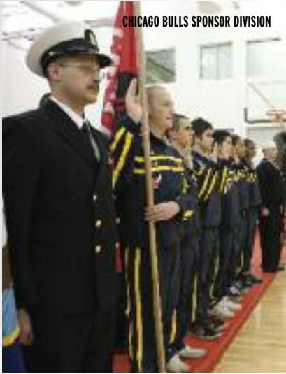
CHICAGO BULLS SPONSOR DIVISION

employees. During the season, Team Mates organizes fundraisers to generate financial resources for a variety of causes to which they lend support.