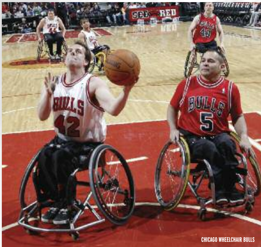
CHICAGO WHEELCHAIR BULLS