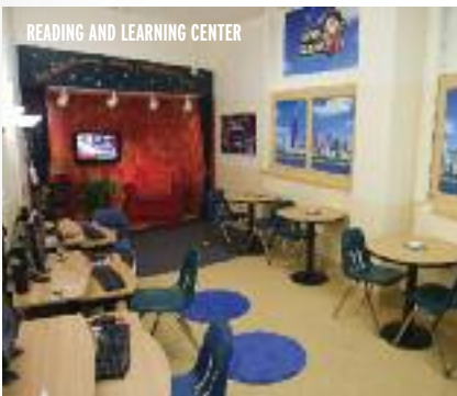
READING AND LEARNING CENTER